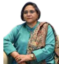
Ambassador Naghmana Hashmi

Four separate panel discussions focused on the awe and lure of the majestic mountains of Pakistan, pristine beaches of the country, and Pakistan's rich archaeological heritage. Pakistan is also home to multiple faiths where thousands visit shrines of religious reverence for Hindus, Sikhs, Buddhists, and Sufi saints of Pakistan. The speakers included the following: